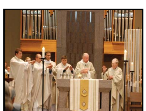
Diocese of Winona Minnesota