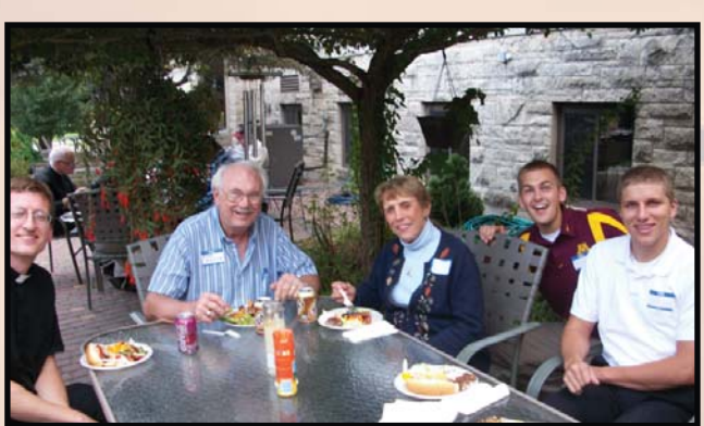
Serra Club Picnic with seminarians, September, 2010.